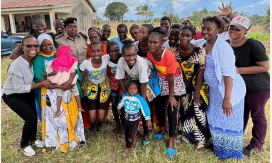
Above: Teen moms and their leaders at YoungLives club in Mtepeni