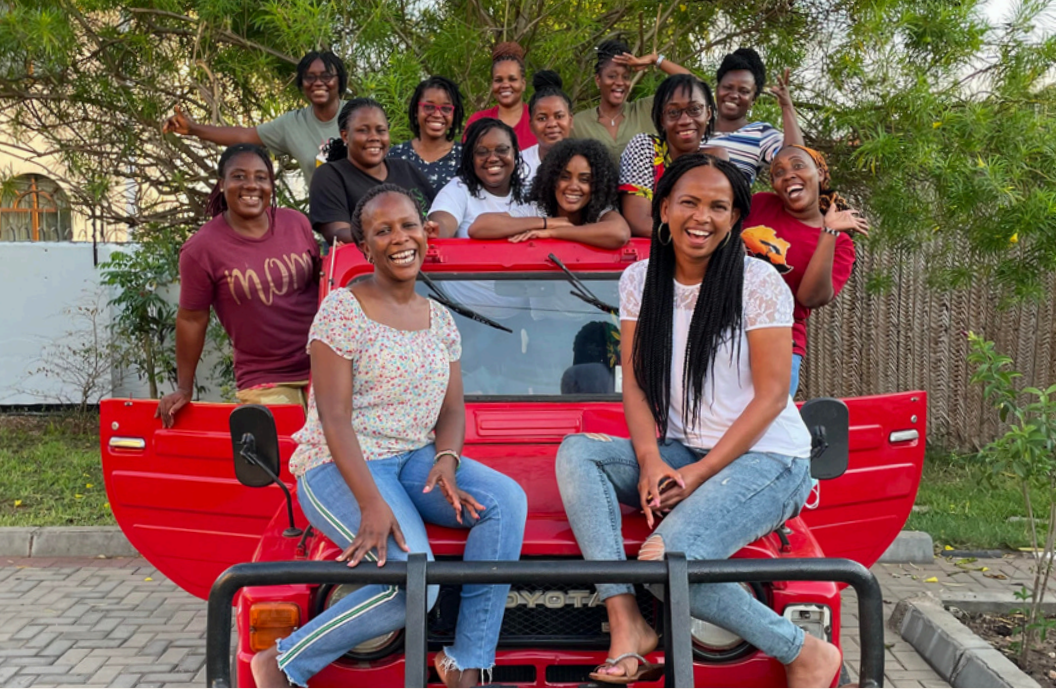
Above: The second cohort of the Women's Leadership Accelerator